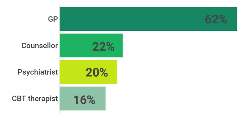
Fig. 3 Services used by the respondents for mental health support

62% of our respondents mentioned using GP services for mental health issues, by far the most commonly-used service. This is followed by counselling (22%), psychiatrist (20%), CBT (16%). Community mental health teams, mental health nurses, community psychiatric nurses, and Child and Adolescent Mental Health service were also mentioned by a smaller number of respondents.